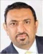
Ali Adnan Ibrahim Adviser, Sustainability and Competitiveness, KSA Center of Government Public Figure