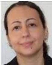
Bárbara Luiza Coutinho do Nascimento State Prosecutor, Rio de Janeiro State Prosecutor's Office Public Figure

Hyun-gu Cho is a South Korean entrepreneur who founded Classting, an AI-powered Learning Management System (LMS). Classting is a platform designed to improve and streamline the educational experience for both students and teachers by incorporating artificial intelligence, data analysis, and various other advanced technologies. The platform offers features such as personalized learning, real-time feedback, data-driven insights, and seamless communication between students, teachers, and parents. By integrating AI algorithms and machine learning, Classting can adapt to individual students' learning styles, strengths, and weaknesses, allowing for a more tailored and efficient educational experience. Hyun-gu Cho's vision for Classting was to create a platform that can bridge the gap between traditional classroom settings and the rapidly evolving digital landscape. His innovative approach to education has garnered significant attention and praise, making Classting one of the leading LMS platforms in South Korea and beyond.